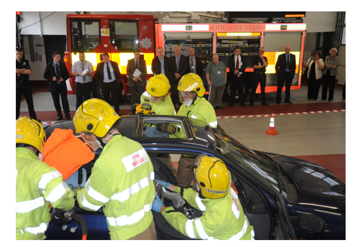
Car Extrication demonstration – Spennymoor Fire Station