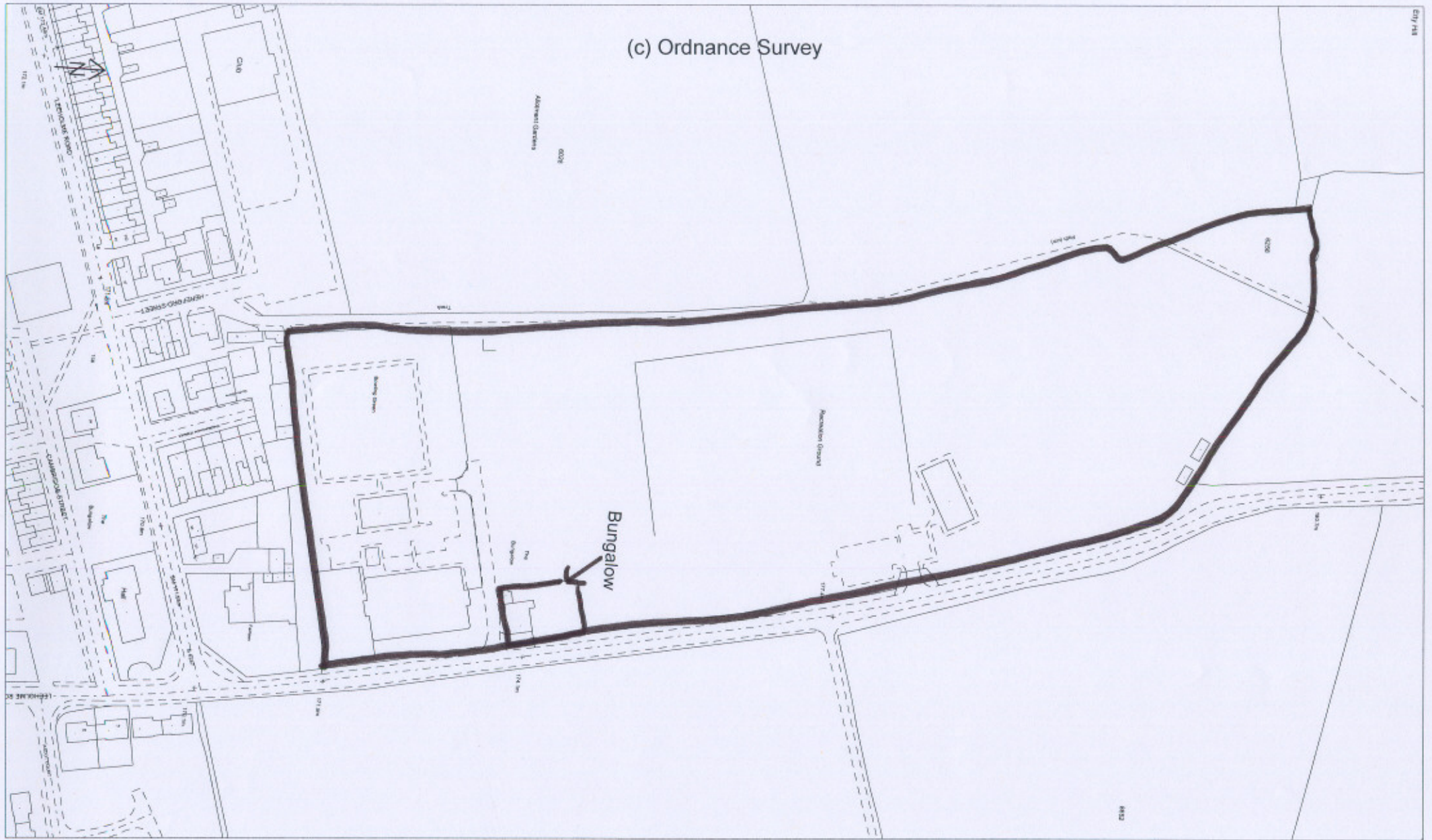
Bungalow at Leeholme Recreation Ground