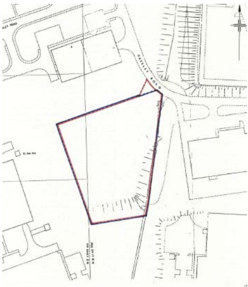
The Application Site

The application site lies within the South West Industrial Estate in Peterlee. Other industrial units of various scales and designs surround it. The site can be seen from the nearby A19 and is currently vacant.