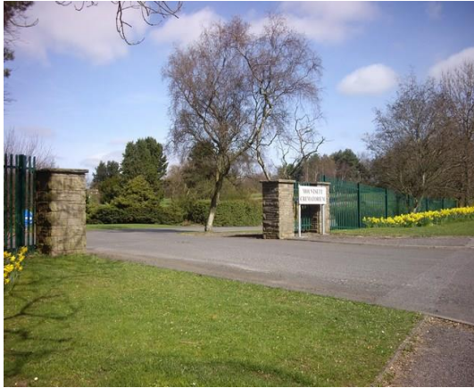
Crematorium front entrance

Unfortunately, sufficiency surveys are not planned to be undertaken across the Councils Portfolio as the resources are not available to do so.