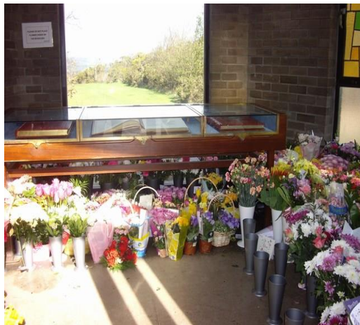
Bookcase within Chapel

Suitability is about whether the property users/customers consider that the premises meet requirements in terms of use. A series of questions are asked around whether staff/customers find the heating/lighting/ventilation/decoration/staff facilities and general aesthetics etc in their opinion as good/fair/poor. This detail helps to inform future investment requirements. In this instance, the premises manager advised in his opinion what the issues were in terms of suitability, and this enabled the gaps to be drawn out. Although we usually find that the premises manager is the best source of knowledge, there may be other suitability issues that staff/customers may be able to highlight which could, subject to service approval and of course resources are included in the premises Investment Plan.