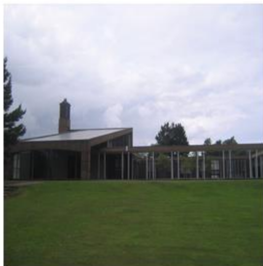
Crematorium general view