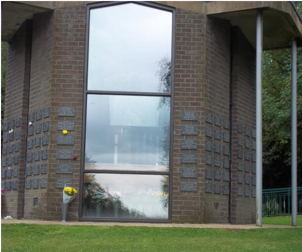
Chapel of remembrance

Work is currently underway regarding making applications for water consents in the first instance, we do however have initial drawing for location of installation if we were to progress.