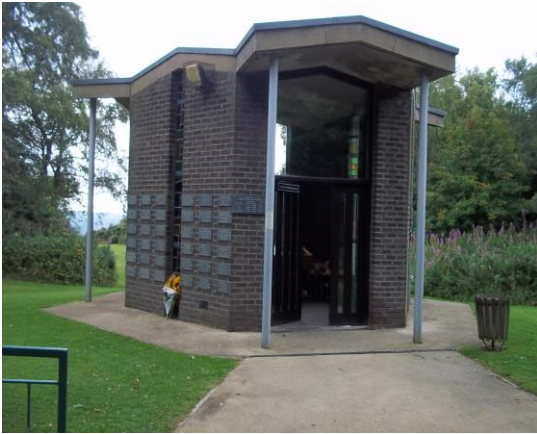
Chapel of Remembrance