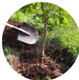
45 hectares of woodland planted since 2020