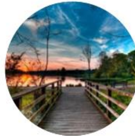
9 parks and 12 Green Flag Awards