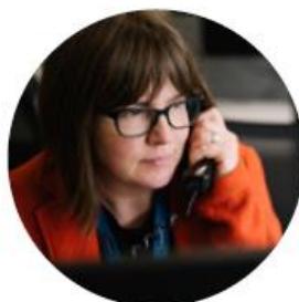
3,250 people receiving home care, 2,100 telecare and 1,050 day care