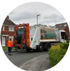
1 million bins emptied each month