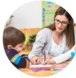
over 5,000 children supported by early help and social care services