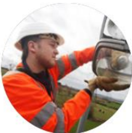
Over 83,000 street lights