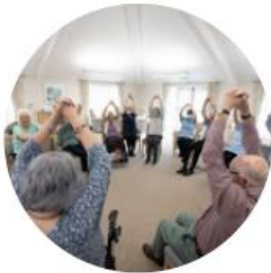
Supported living and extra care establishments