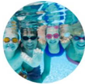
5,000 people learning to swim in our pools