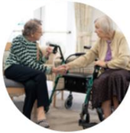
3,050 older people receiving residential or nursing care