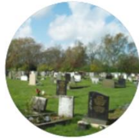
2 crematoria, 46 cemeteries 96 closed church yards