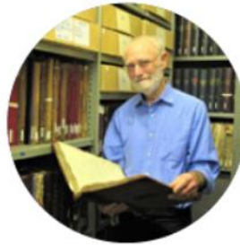
Nearly 10,000 engagements with our archives