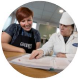
5,000 food businesses inspected