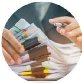
18,000 new benefit claims processed each year