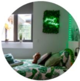
12 children's homes