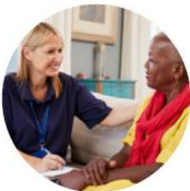
750 people in supported living