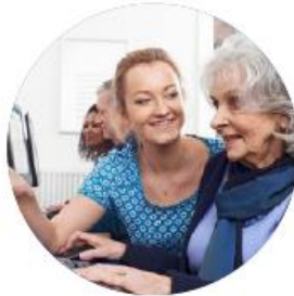
Over 200,000 library members