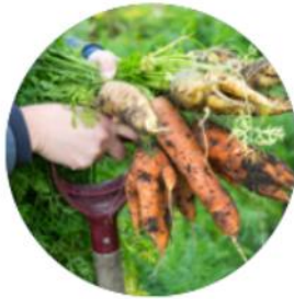
148 allotment sites