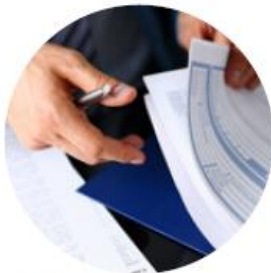
57,000 Council Tax Reduction claimants