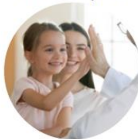
15 family hubs