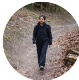
3,526 km of public rights of way