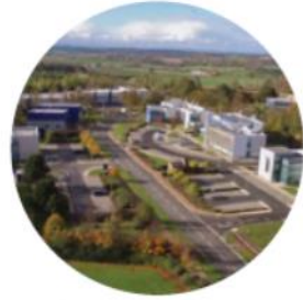
Over 800,000 sq ft business space managed