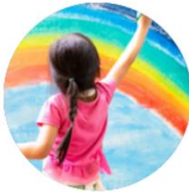
Corporate parent to over 1,200 children