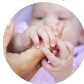
More than 2,500 births and 5,000 deaths registered each year