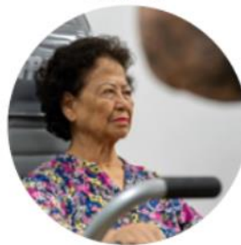
3m visits annually to our leisure centres