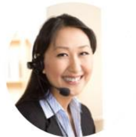
Over 500,000 calls answered by customer services each year