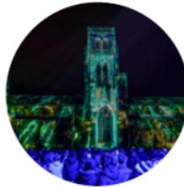
9 major events organised last year