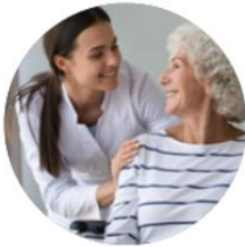
16,400 adults supported by social care

We have an annual budget of around £1.3 billion which helps us provide more than 800 services to more than 522,100 people. The following are examples of services delivered over the last year: