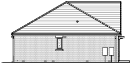
2 Gable Elevation (1) - Planning 1 : 100