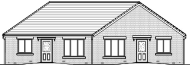
1 Front Elevation - Planning 1 : 100