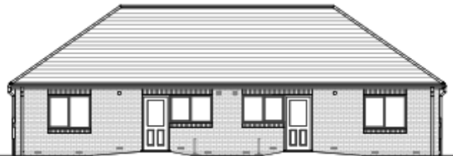
3 Rear Elevation - Planning 1 : 100