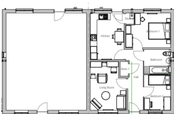
5 Ground Floor Plan 1 : 100