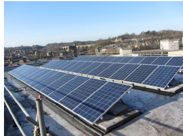
Gala Theatre Durham solar photovoltaic array