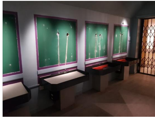
Figures 4. & 5. Old display areas at Aykley Heads, including dismantled medal cases.