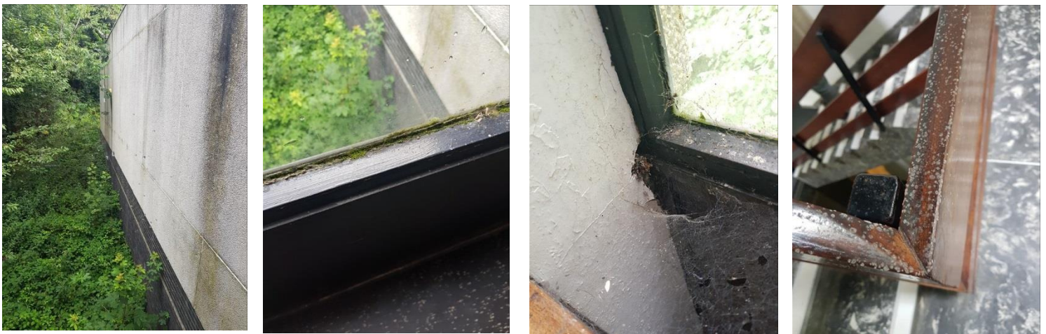
Figures 10., 11., 12. & 13. Examples of biological activity and evidence of the vulnerable position of the building, cut into the hill-side, enhancing the potential for damp penetration at ground level.

3.7 Facilities for exhibition and events are substantial, with large exhibition rooms and, although rudimentary, a loading bay. The lift attending the loading bay is seriously inadequate and would now be deemed unacceptably small and narrow for human use by Building Regulations. A reconfiguration of use of space within the building might make it viable for events, performances and short-term exhibitions that do not require support from the Government Indemnity Scheme (which would require standards-compliant security improvements to the structure and the infrastructure and approval of these by the ACE National Security Adviser). The display area and fittings, described above, are degraded and no longer fit for purpose. The medal cases in the gallery on floor 2. were largely dismantled and are no longer useable. But the scale of the spaces suggests they may lend themselves to being repurposed. The main weaknesses of the building are the roof and the position, cut in the hill-side with possibly inadequate water-proofing.