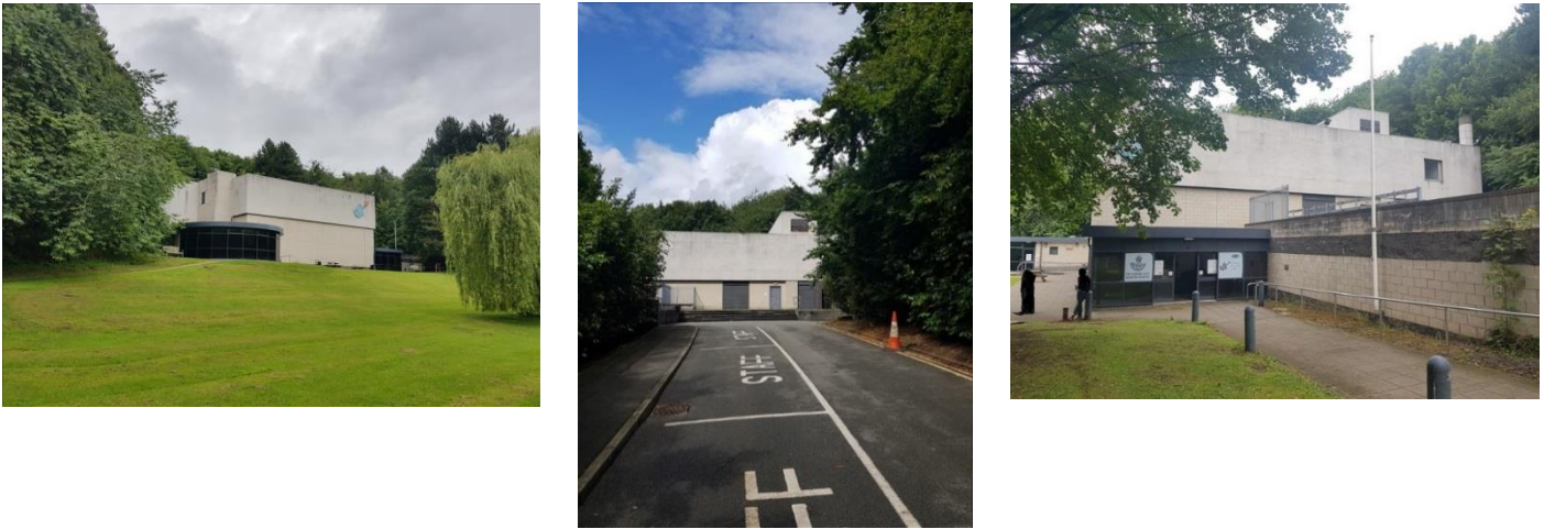
Figures 1., 2. & 3. Views of Aykley Heads including loading entrance, formerly glazed public entrance.

3.3 The display facilities on the lower ground level are now empty and partly dismantled (see figures 4. and 5. below). The cases have no internal climate buffering facilities ('gel trays') that would otherwise permit stabilisation of RH inside them, something that is standard nowadays. The larger of the cases present risks to staff in requiring very large sheets of glass to be removed in order to access the vitrine (the space inside a display case). The cases are lit internally with fluorescent strip lights. It was reported that access to alter the lighting was challenging, being from the top of the wall panel/case structure. Spotlights in the ceiling complement the case lights and the bulbs appear to be LEDs. The whole display area is run down and partly dismantled. The absence of seals and of the capacity to buffer cases means that they could no longer be used to display heritage safely. It is likely that an air conditioning system, with vents visible in the ceiling, was relied upon to try to control temperature and RH of the whole room, rather than fitting modern standard display cases. Interviews with staff including those working in the years before closure in 2016, revealed testimony such as: