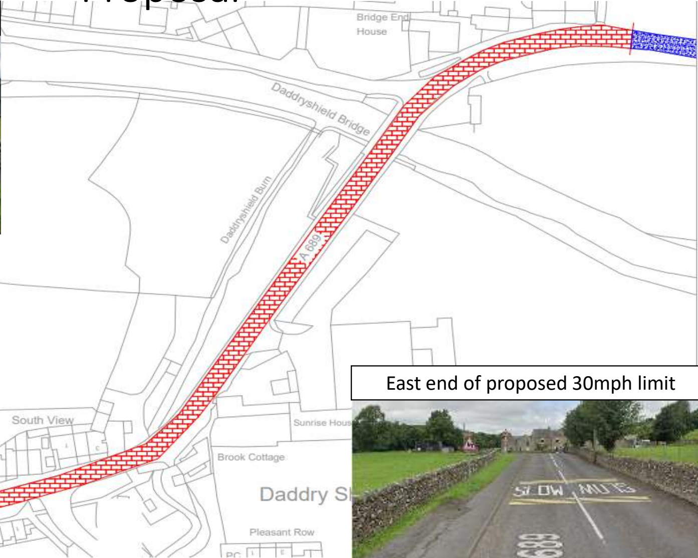
East end of proposed 30mph limit