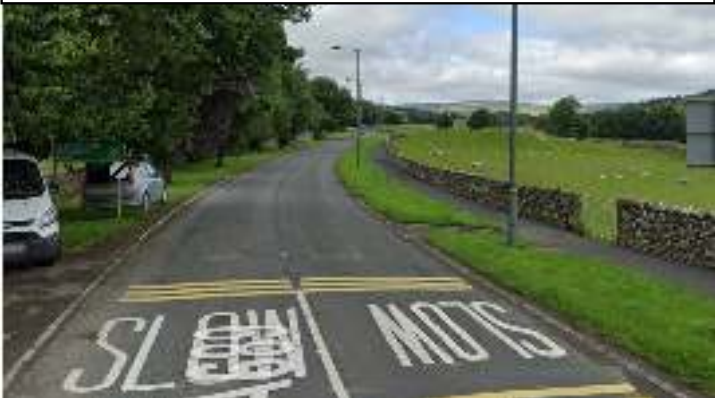
West end of proposed 30mph limit