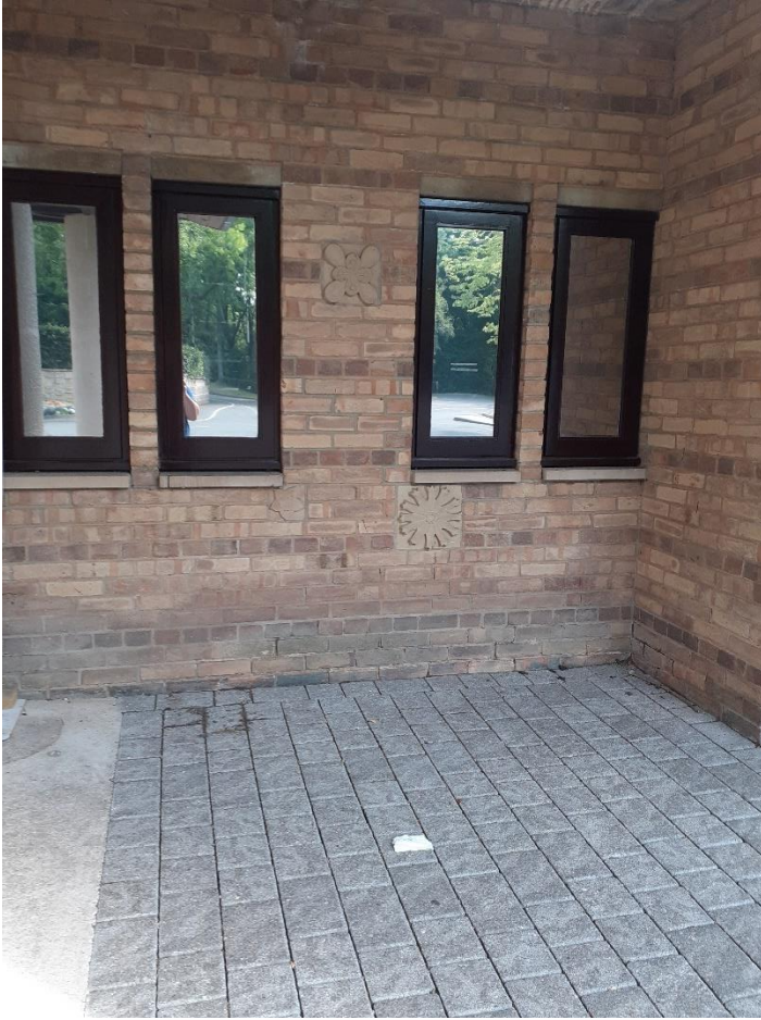
Photograph 1: Office room where windows can't be opened