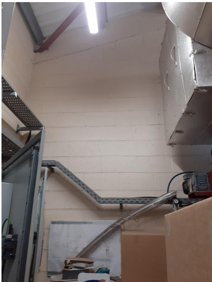
Photograph 3: Cremator Room location of wall mounted axial fans 1 at each side of wall