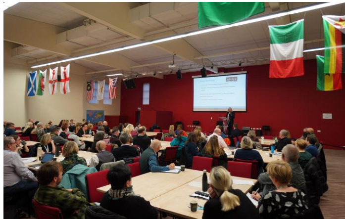
Listening to a speaker at the County Durham Partnership Event

21 Approximately 120 people attended the event which included representatives of the County Durham Partnership as well as voluntary and community organisations and groups.