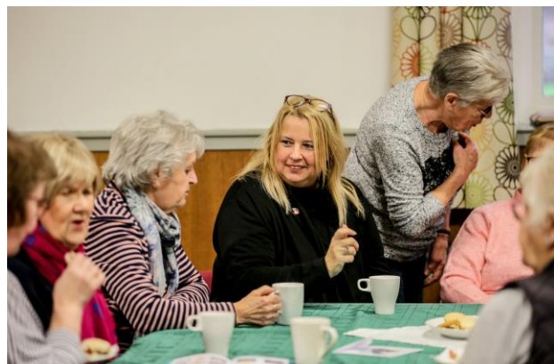
Having a chat and a cuppa at a warm space in Durham