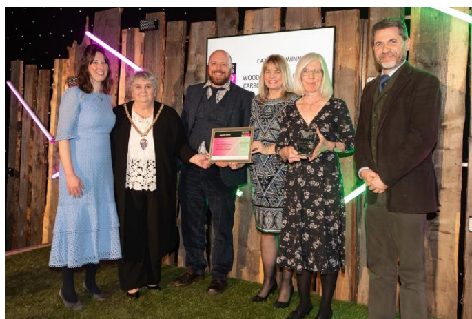
Winners from Woodland Primary School accepting their trophy at the Environment Awards Ceremony

90 Winning the Schools and Colleges category at the event was Woodland Primary School in Teesdale, for its carbon reduction project. A grant of more than £100,000 has been used for a green retrofit at the school, which had traditionally relied on an oil-filled boiler for both heating and water. Under the Public Sector Decarbonisation Scheme, an air source heat pump, ground level solar panels and LED