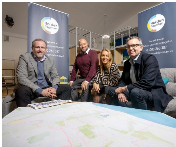
Planning for the Horden mine water project

99 We are working alongside East Durham Trust, the Coal Authority, East Durham Business Services and community representatives to identify ways in which mine water heat can be used in Horden.