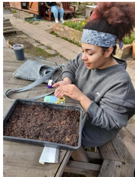
Taking part in a Bridge Creative activity

52 Many volunteering opportunities are not accessible for people with learning disabilities unless they have support to help them. The funding awarded to the project enables them to work with individuals to support them with every stage of the volunteering process, from finding the right opportunity, to filling in application forms and supporting people to attend and 'settle in' to their placement until people are confident enough to attend alone. The project also delivers employability workshops, supporting people with confidence-building, interview techniques and Curriculum Vitae checks.