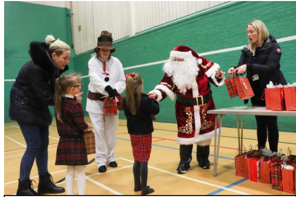
Meeting Santa at Christmas Fun and Food

34 Over the Christmas period, 98 projects were delivered from community partners through the AAPs; Community arts; Christmas parties at leisure centres and free swimming, with 4568 individual children and young people attending the sessions: