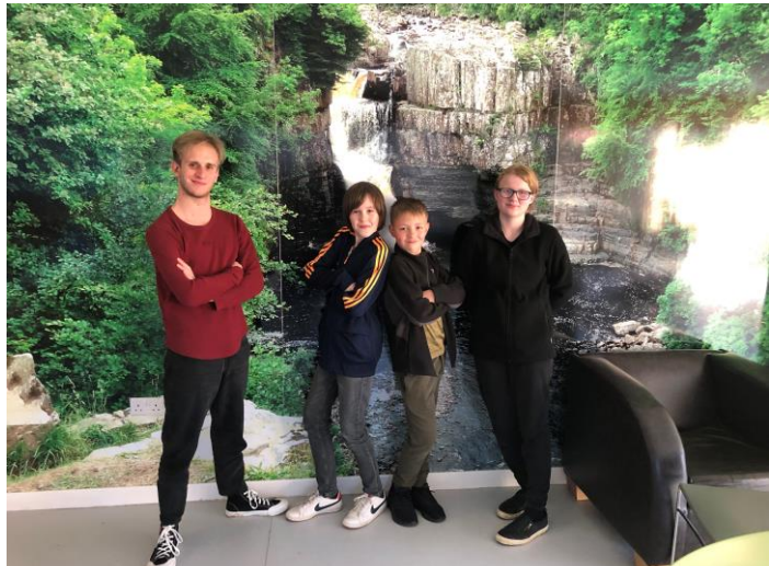
Members of the 3 Towns' Youth Panel

105 Jointly managed by the AAP and the Youth Panel, the fund awards grants between £200 and £500 to organisations for projects for children and young people up to age 19.