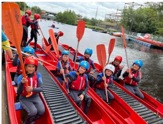
Children preparing for a canoeing activity at an Easter Fun and Food session.

62 During the May half term holiday, the Poverty Action Steering group gave £71,457 to fund 60 AAP projects, delivered across the county, and partners continue to offer wonderful creative projects, engaging children and young people in experiences and opportunities they wouldn't ordinarily be able to access.