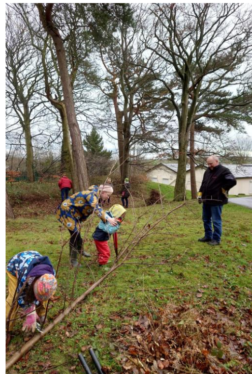
Families helping out at their local church