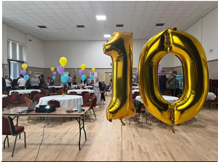
Celebrating the tenth anniversary of AiCD