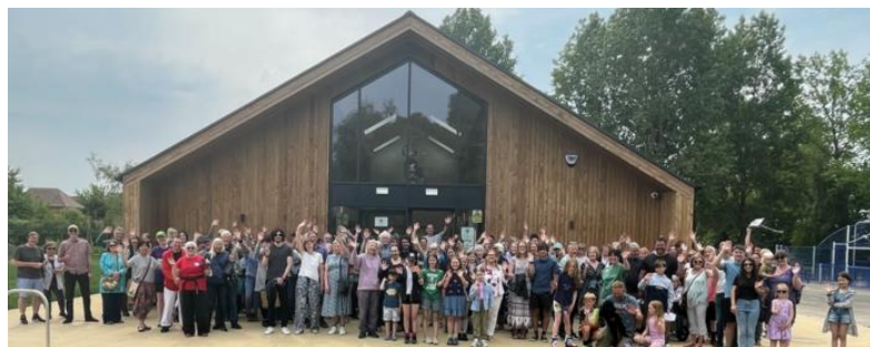
Celebrating opening Merryoaks Community Hall

141 The Lowes Barn Community Project was established several years ago in the Neville's Cross area of Durham. The group have been working toward opening a new community