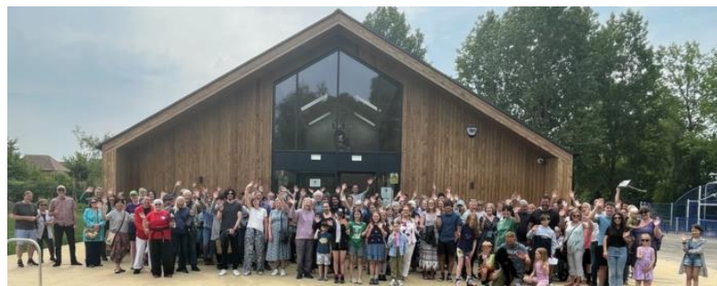
Celebrating opening Merryoaks Community Hall

141 The Lowes Barn Community Project was established several years ago in the Neville's Cross area of Durham. The group have been working toward opening a new community