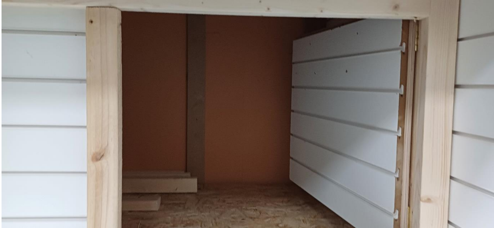
Electromagnetic false wall