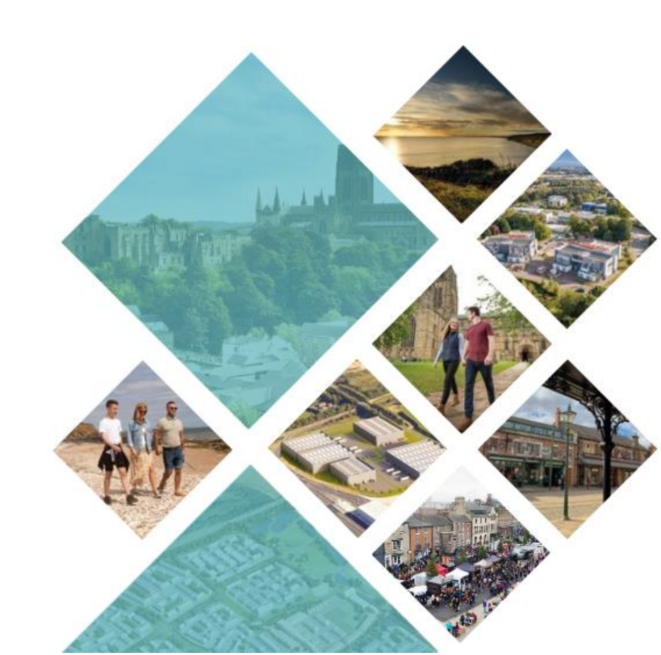
Page 56 of 56