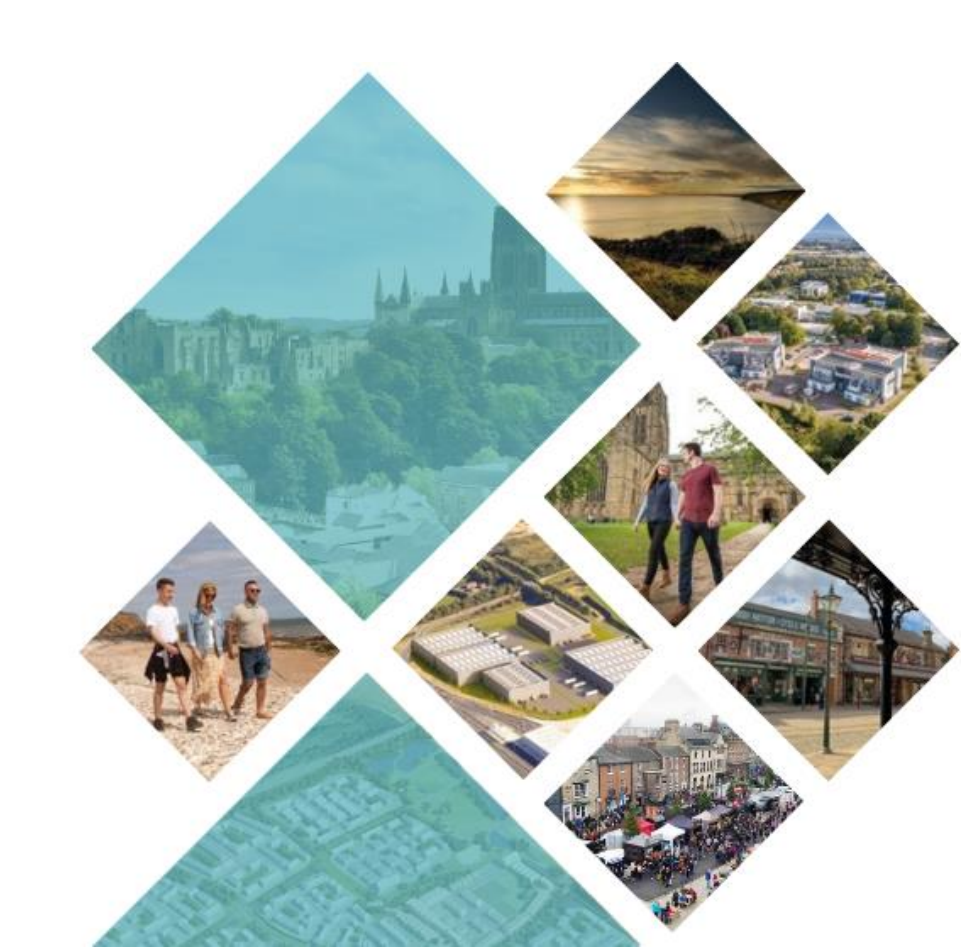
Page 56 of 56