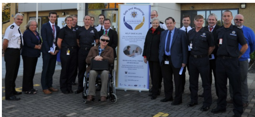
Members with CDDFRS Firefighters